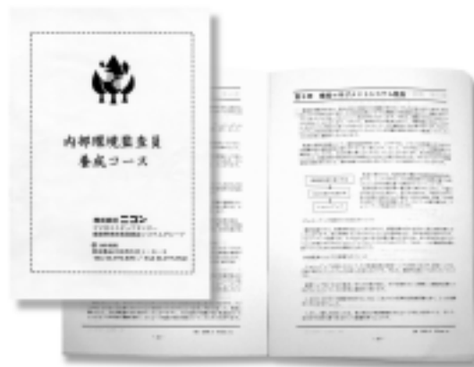
Internal environmental auditor development course

Our Environmental & Technical Administration department is providing education and support for organisations within Nikon — and outside as well — that wish to acquire ISO 14001 and ISO 9001 certification.