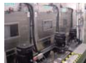
The all-water washing system at Yokohama Plant

At our Yokohama Plant, the surface treatment processing division has worked hard to develop a washing technology that reduces the environmental burden to a minimum, through eliminating the use of organic solvents and surfactants, and has succeeded in putting into operation an all-water washing system, which was introduced into the mass-production process in fiscal 2005.