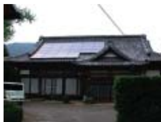
Second prize: Fusion