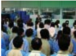
Nanjing Nikon Jiangnan Optical Instrument Co., Ltd.

These visits resulted in recommendations for further instruction and support at each plant. Promotion of environmental protection, based on recycling and co-existence with nature, continues to spotlight environmental management at our overseas plants.