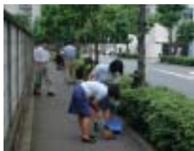
Cleaning up around Ohi Plant

other plants in Ohi, Sagamihara and Mito to begin their own cleanup activities. Kumagaya Plant representatives cleaned up JR Kagohara Station in January to conclude the financial year. We will continue to schedule regional activities in order to ensure that we remain citizens in good standing with our local communities.