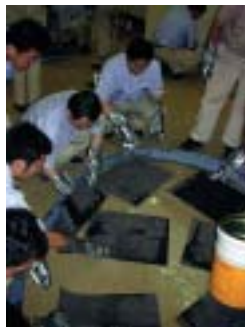
Emergency countermeasures (simulation of accidental leak)