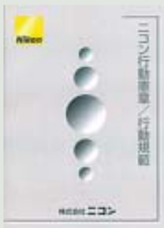
Nikon Charter of Corporate Behaviour/Code of Conduct

The purpose of Nikon's Charter of Corporate Behaviour is to ensure that the directors, officers and employees of Nikon Group Companies exercise sound and ethical business practices and good business judgment, so that Nikon can continue to gain the trust of Nikon Group customers, shareholders, employees, business partners, and society, and thereby enhance Nikon's brand value.