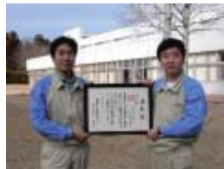
Excellence Award for Electrical Rationalisation

In February 2005, the Mito Plant received an excellent review for its efforts related to energy saving, and was awarded an “Excellence Award” by the Kanto Regional Electric Power Rationalisation Committee.