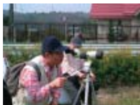
November: Walk Rally