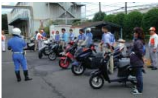
Attitude for road safety

Our plant employees often commute by car, so our plants hold safe driving workshops for their benefit in cooperation with local police stations and traffic safety associations. Workshop lectures raise awareness and safe driving skills to such a degree that the Sagami-hara Plant was awarded for contributing to road safety through long-term safe driving management by the chief of the Kanagawa Police Station and a chairperson of the Kanagawa Safe Driving Management Association.