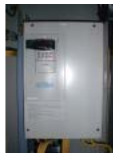
Pump inverter equipment introduced at the Mito Plant