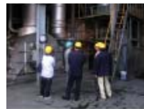
Visit to a plant's waste processing facilities (Yokohama Plant)

Environment Month featured seminars on subjects such as ISO 14001 and “green” purchasing, as well as a photo contest on the theme of the environment. We allowed visits to waste processing facilities at all of our manufacturing plants, and created environmental panel displays. Employees took part in clean-up campaigns outside our manufacturing plants, raising environmental awareness among themselves and neighbouring communities.