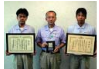
Excellence in Hazardous Substance Handling award Excellence in Pressurised Gas Handling award

In June 2004, the Sagamihara Plant was awarded for Excellence in Hazardous Substance Handling from the Kanagawa Dangerous Substance Safety Association, and for Excellence in Pressurised Gas Handling from the Kanagawa Prefectural Central Administrative Centre, acknowledging Nikon’s exemplary standards in handling dangerous substances and pressurised gas.