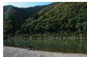
Commendation: Clear water