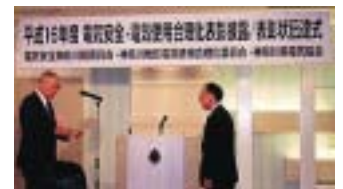
Excellence Award for In-Company Electrical Facilities

In March 2005, the Sagamihara Plant received an excellent review for its activities dealing with electricity and the safety of its electrical equipment. The Plant received an Excellence Award from the Electrical Safety Kanto Committee for organisations working on in-company electrical consumption facilities.