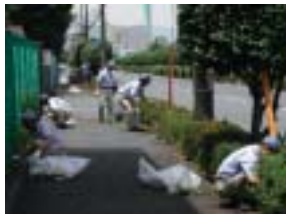
Cleaning up around Sagamihara Plant