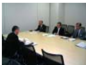
Interview with top management

*By June 2005, the Ohi Plant, Yokohama Plant and Mito Plant were integrated.