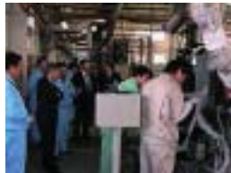
Hikari Glass Co., Ltd (Changzhou)