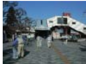
Cleaning up JR Kagohara Station plaza