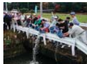
December: Cleaning of Ishikawa river (release of fingerlings)