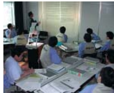
Step-up seminar for internal environmental auditors