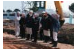
Nikon Imaging (China) Co., Ltd.