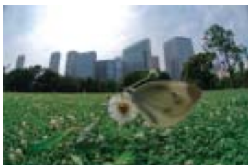
First prize: Butterfly among high buildings