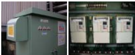
Pump inverter equipment introduced at the Kumagaya Plant

end, the Kumagaya Plant switched over to Energy Service Company (ESCO) pump inverters and the Mito Plant introduced pump inverters in fiscal 2005.