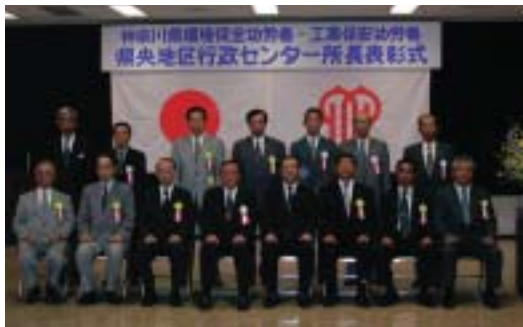
Attitude for safety at work

As a result, the Sagami-hara Plant was awarded for Excellence in Hazardous Substance Handling from the Kanagawa Dangerous Substance Safety Association and for Excellence in Pressurized Gas Handling, from Kanagawa Prefectural Central Administrative Centre.