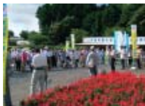
July: Hinuma Clean Challenge

initiative involving residents, businesses, organisations and governments (national and local) involved with Hinuma and related rivers, and aims to improve water quality. It was established in March 2001 by the Mito Plant and other founding members.