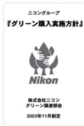
Nikon Group Green Purchasing Implementation Guidelines

Nikon Group manufacturing subsidiaries have consented to implement this new system in fiscal 2005, regardless of whether or not the old green procurement system had been in place, and will be followed in the future by our sales subsidiaries.