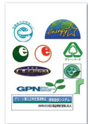
Green Purchasing Registration Mark and Database